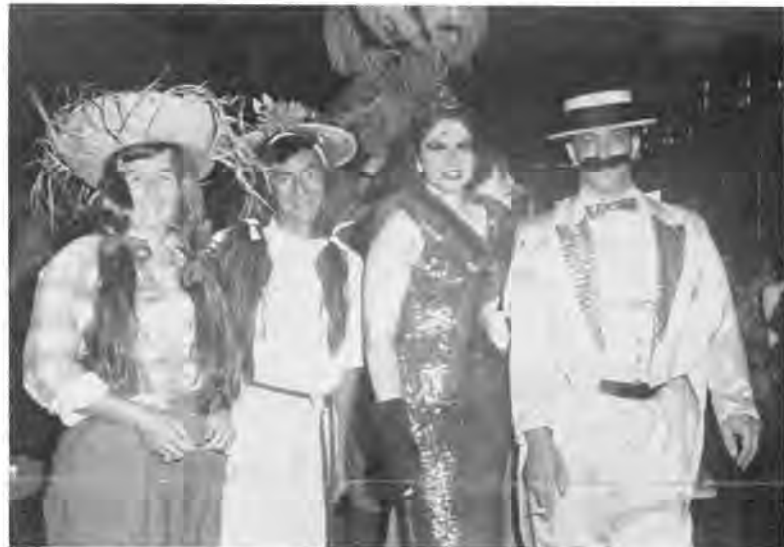
And awaaaay we go! Masquerade night always brings out the talent (and ham) in APD. Pictured are some of this year's prize winners.

TRADITIONAL MASQUERADE A SOCIAL HIGHLIGHT