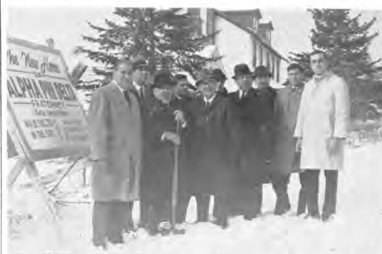
The National Chapter House foundation trustees at ground-breaking ceremonies for the new Beta Lambda House, St. Francis College, Loretto, Penna.